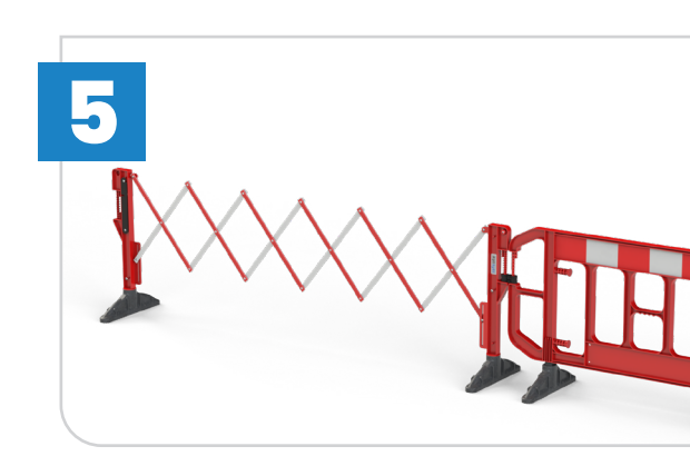
This barrier attaches to another titan expander or titan barrier via the Flexiclip. Push the clip at the back of the Flexiclip and slot to attached barrier.