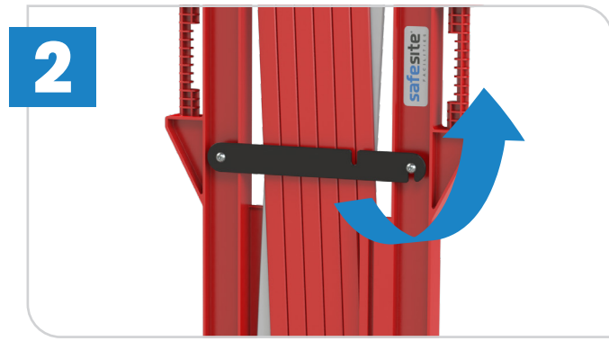
Unhook the hinge.