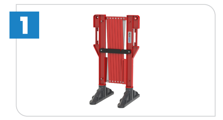
Place the barrier in desired position

The Titan barriers connect with Chapter 8 Titan barriers and expand to up 3.1 metres.